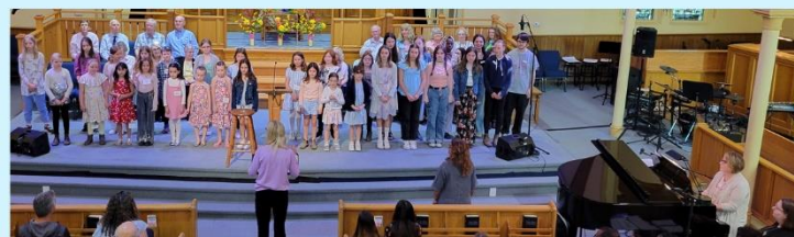
The amazing First Impressions Children & Youth Choir