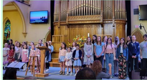
First Impressions Children & Youth Choir at Sunday Worship